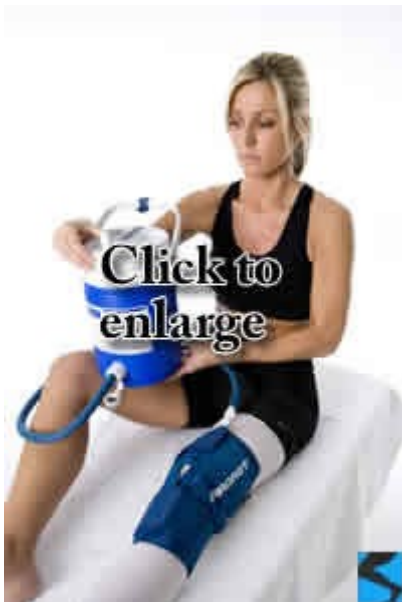
Cryocuff connected to ice/water bucket

You may also have a Cryocuff (cold compression device) on your knee which will be put on in the operating theatre. This device helps to control your swelling as well as helping with your pain control.