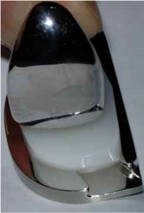
Picture of a unicompartmental knee replacement

The designs of the unicompartmental types of knee replacements have improved over the years, as has the sophistication of the instruments used to implant these types of artificial joints. The unicompartmental knee replacement also has smaller, less invasive incisions.