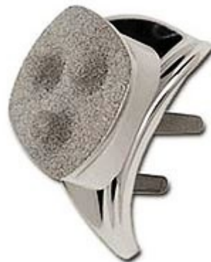
A patellofemoral joint replacement

If two or more compartments are damaged, the uni may not be the best option. The uni is also less desirable for a young, active person because it may not withstand the extremes of stress that high levels of activity create. It is best suited for the older, slim person with a relatively sedentary lifestyle. Only between six and eight out of 100 patients with arthritic knees are good candidates for a unicompartmental knee replacement.