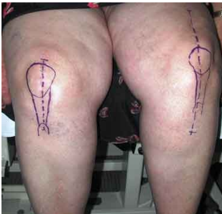
Photo showing a standard TKR incision on patient's left knee (by another surgeon) and minimally invasive incision TKR by Mr Jari on patient's right knee

The minimally invasive approach to the total knee replacement is appropriate for most patients who have reasonable motion without significant deformity. Hospitalization is usually reduced to one to three days among these patients, and the need for an extended stay for inpatient rehabilitation may be reduced or eliminated in most patients.